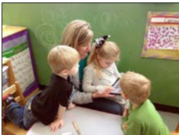
Students learn to spell on iPads at ARC of Walker County