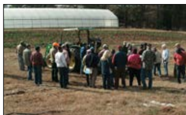
Coosa Valley holds “NRCS High Tunnel House Outreach Workshop” for limited resources producers in Randolph County.