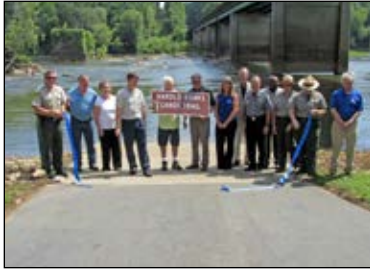
“Harold Banks Canoe Trail” at Horseshoe Bend, part of the Alabama Scenic River Trail.