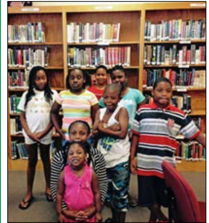
Building Resources Public Library Project

Kids 'N Ag (Elmore): To provide 4-6 grade students the opportunity to learn about agriculture.