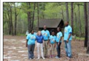
Bullock County Groundwater Festival