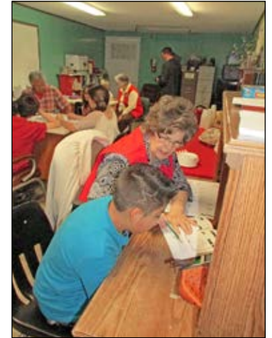
Franklin County Foster Grandparent Mentoring a Child

One Place of the Shoals Building Security and Technology Project: Purchase building security and technology including a card reading system, a panic button, and a strobe light from Certified Alarm; televisions and wall mounts used to monitor the security cameras; and phones for One Place investigators.