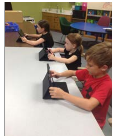
Hamilton Elementary Students Trying Out Their New iPads