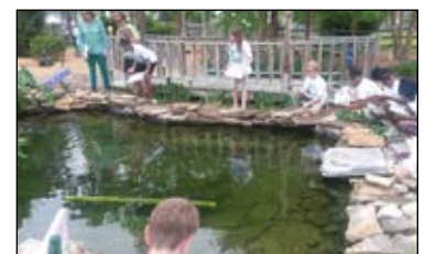
Houston County conducting a groundwater festival for fourth graders