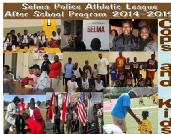
Selma Pal Afterschool

Equipment Fire Truck: Purchase new equipment for the truck.