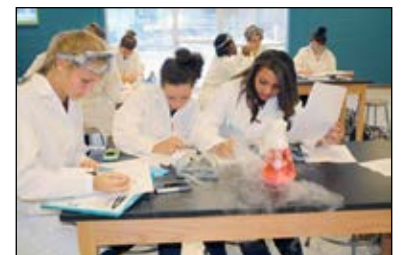
Students at the Lecroy Academy

Equip two classrooms at the Chilton County Technical Center to enable teaching of engineering, computer science, critical thinking skills, teamwork and math. The program serves all six county schools.