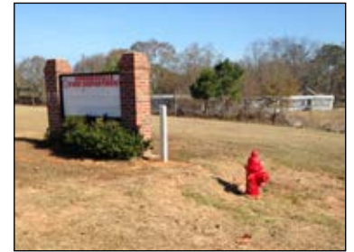
Honoraville VFD installed a new fire hydrant to train firefighters

Walk in the Forest: This will be a day for students to have a forestry and wildlife field day. They will learn about forestry practices, forestry stewardship and wildlife.