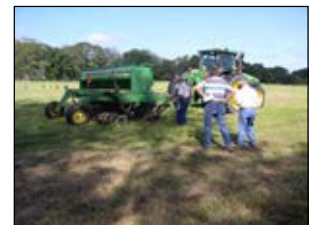
No Till Drill