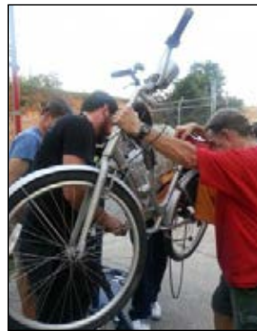
Delta Bike Project

2015 Education and Outreach: These funds were used to provide grant training education for council members and others who are involved with getting the Resource and Conservation message out.