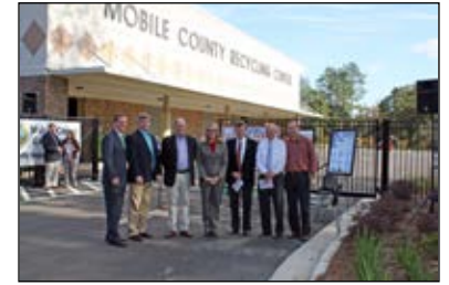
Mobile County Recycling

Escambia County Progressive Agriculture Safety Day: Materials and supplies were purchased for shade, seating and etc. This an annual education event held for three days for all of Escambia County 5th graders. There are approximately over 500 students that attend and learn about safety in the areas of chemical, electrical, drugs, tractors, fire internet and being home alone.