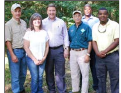
U.S. Congressman Mike Rogers attended a Clay County forestry field day event

Cherokee County High School Baseball Field (Cherokee): Replaced existing backstop with new net to reduce a safety hazard.