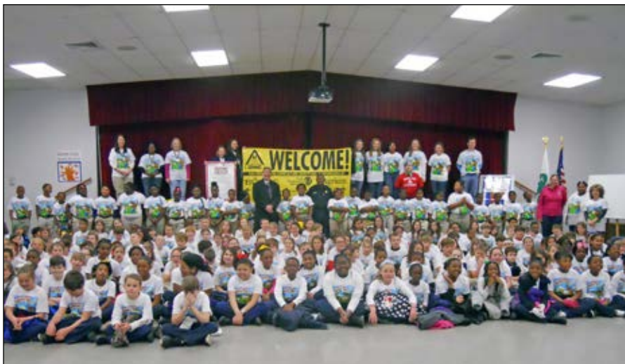
Agriculture Safety Day

Bay Area Food Bank Food Distribution: With a grant from GCRCD the Food Bank's Produce Drop Program was able to distribute over 33,834 pound of food in Mobile County and 16,165 pounds in Baldwin County.