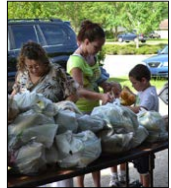
Healthy Food Distribution

This center is home away from home to about 100 seniors. Financial assistance was provided to help purchase products and items geared to enlighten seniors in technology, physical strength with exercising and dancing and also to stimulate their minds with games and crafts.