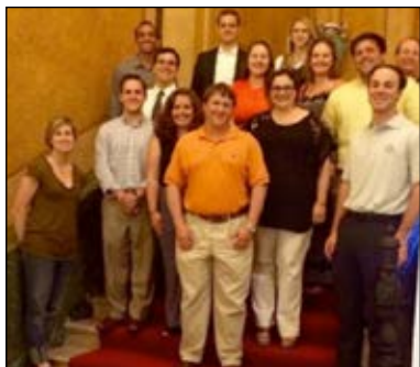
Employees of the Alabama Theatre stand on Carpet funded by Cawaco