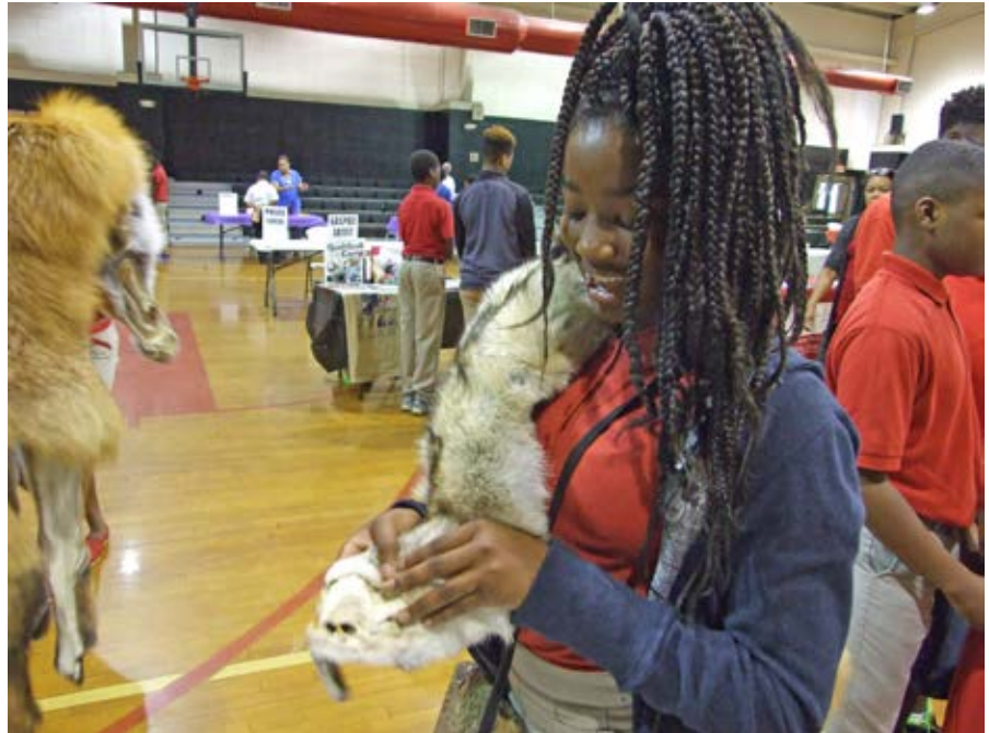
Urban Sprawl Meets Wildlife

Urban Sprawl Meets Wildlife (Montgomery): To develop a signature “spotlight” program entitled “Urban Wildlife 101” that will couple notable wildlife curriculum with a hands-on Urban Wildlife Educational Resource Kit to be used in Autauga, Elmore, & Montgomery Counties.