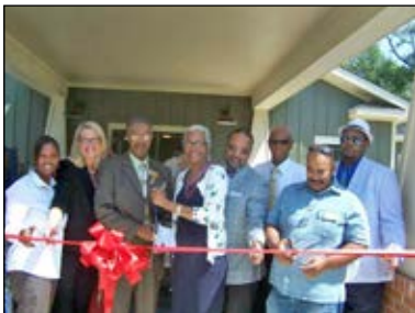
Mount Vernon Senior Citizen Center