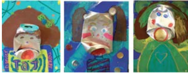
5th grade Cornerstone student self-portraits using recycled materials

Clanton/Goosepond Park Fitness Signage: Chilton County YMCA installed signage along the popular walking trail that outlines various stationary exercises an individual can incorporate into their physical fitness routine.