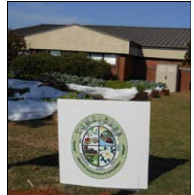
Tombigbee logo in TMSE garden

Imagine Me – Enhancement: Books, supplies, internet access, and instructors to keep the Imagine Me program in operation.