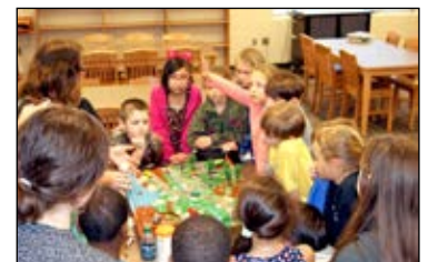
Moundville Elementary EnviroScape