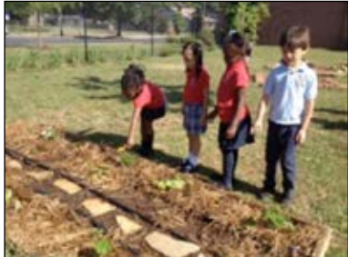
Children at Cornerstone learning about herbs