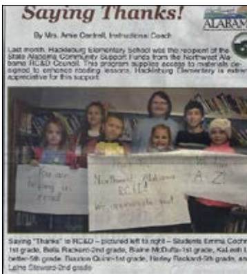
Hackleburg Elementary Students Thanking RC&D

Operation GROW: Cover expenses accrued for the educational Operation GROW classes which were designed to educate veterans on agriculture to give them opportunities to pursue agriculture as employment.