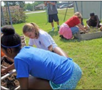
Y Grow Project Participants Weeding their Gardens