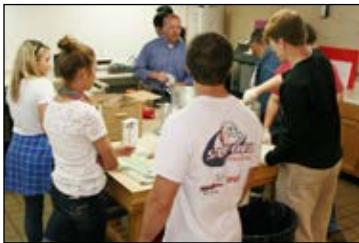
Fort Payne High School: students grew produce, harvested and then cooked for the homeless at a local shelter...two times....fall and spring!