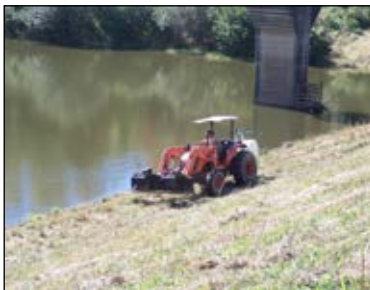
Justin Bailey-Coosa Valley RC&D Watershed Contractor is shown performing operations and maintenance on one of the 105 watershed structures that are maintained by the council annually.