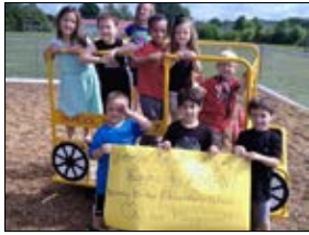
Barkley Bridge Playground

Senator Orr showcasing our Tree Canopy project